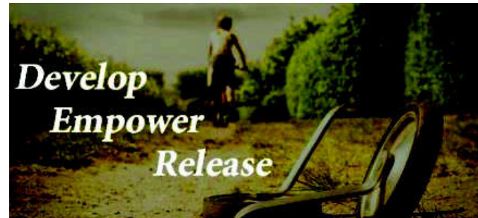
The theme of this year's Europe Conference has a familiar ring to it...

We are looking forward to building upon these networks (and a growing relationship with partners like Joni and Friends ) to see many lives, families and communities throughout Europe touched and transformed by the good news.